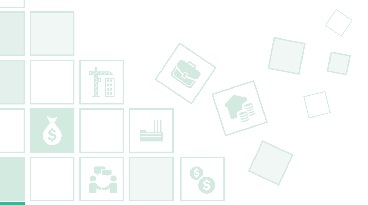
Consolidated financial information for special purpose for 2021 year

There are no other subsequent events, which need to be communicated as per the requirements of the Conceptual Framework.